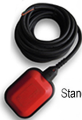
Standard Float Switch